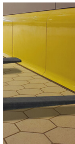
Heavy duty Skirting