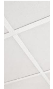
Suspended Ceiling Grid